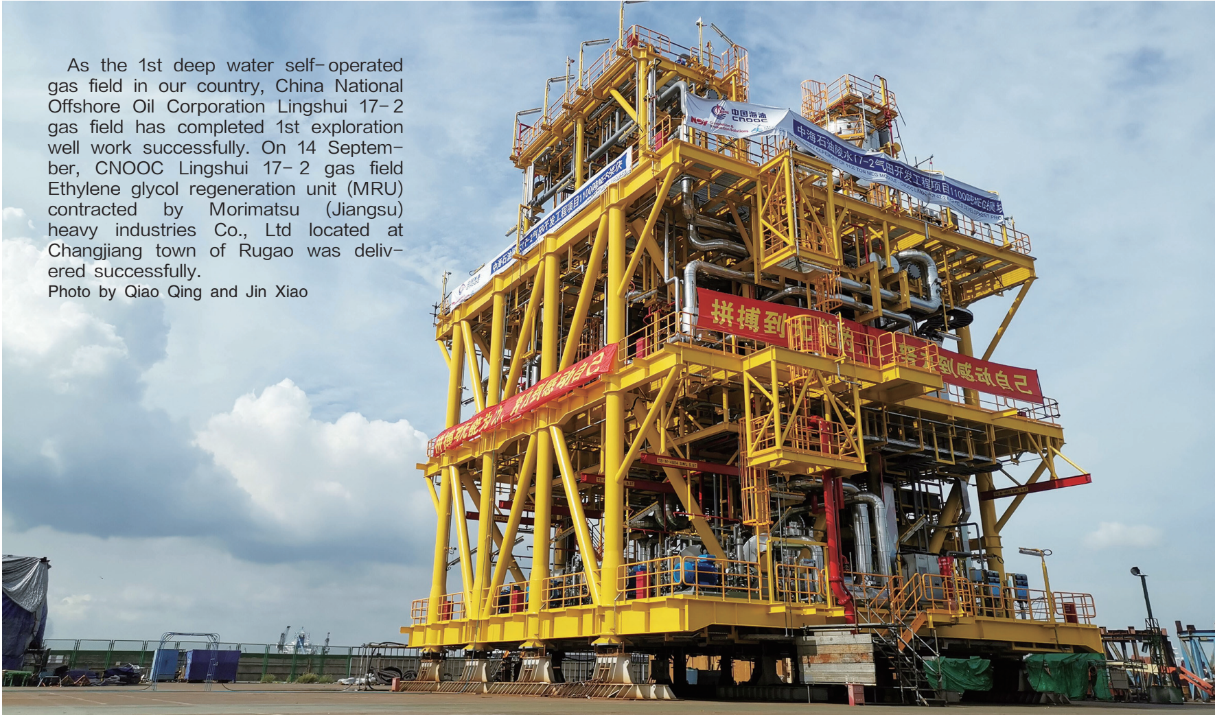
As the 1st deep water self-operated gas field in our country, China National Offshore Oil Corporation Lingshui 17-2 gas field has completed 1st exploration well work successfully. On 14 September, CNOOC Lingshui 17-2 gas field Ethylene glycol regeneration unit (MRU) contracted by Morimatsu (Jiangsu) heavy industries Co., Ltd located at Changjiang town of Rugao was delivered successfully.