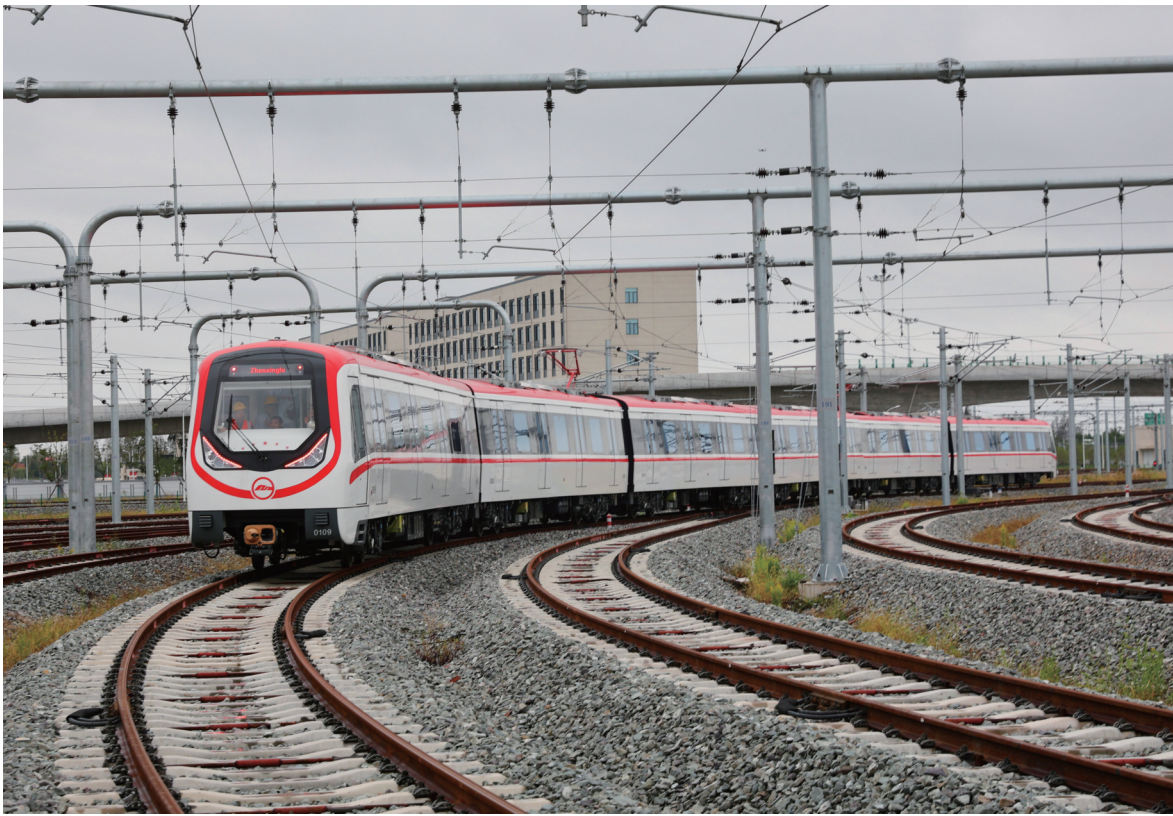
On 15 October, Nantong rail transit line No.1 phase 1 project bullet train test was started officially. It was a sign that the project entered final stage, and meant one more step towards the opening and trial operation in 2022.