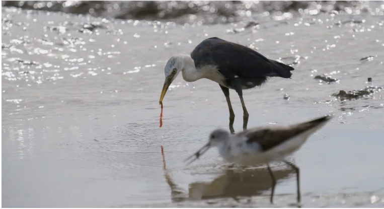
Birds fans of our city discovered traces of wild Spotted Heron along the coast in Rudong. It might be the first discovery in mainland area. Birds lovers from all over the state drove and flew here overnight to see them.