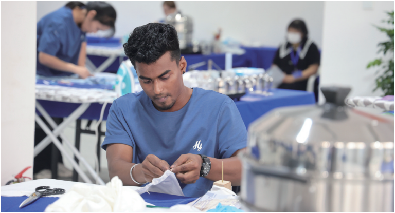
On 12 October, ‘Huayi cup’ national textile intangible cultural heritage tie-dye professional skills tournament final was held in Hai’an. The theme of the competition is ‘tie-dye and modern life’.