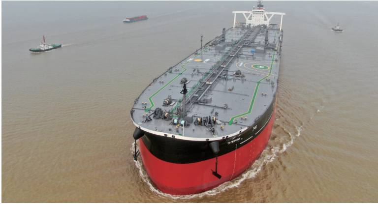
On 15 October, the first 300 thousand ton VLCC ‘COSCO 325’ built by Nantong COSCO this year passed the trial voyage in Nantong navigation control area.