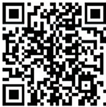
Scan the QR code to watch the video

As a model of economic and trade cooperation between China and Austria, China-Austria Su Tong Eco-Park has settled in Suxitong Industrial Park for 10 years. In the past ten years, the park has carried out targeted investment promotion focusing on frontier industries such as machinery and equipment manufacturing, energy and environmental technology, automobile and biomanufacturing. More than 10 ‘hidden champion’ enterprises in German-speaking areas have successively settled and developed.