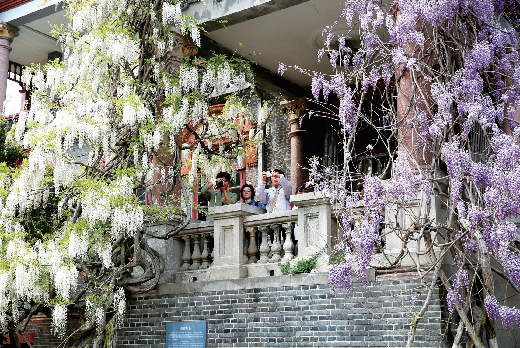
On 9th April, two wisterias of more than 100 years in Nantong Museum bloomed, attracting citizens to take photos and watch.